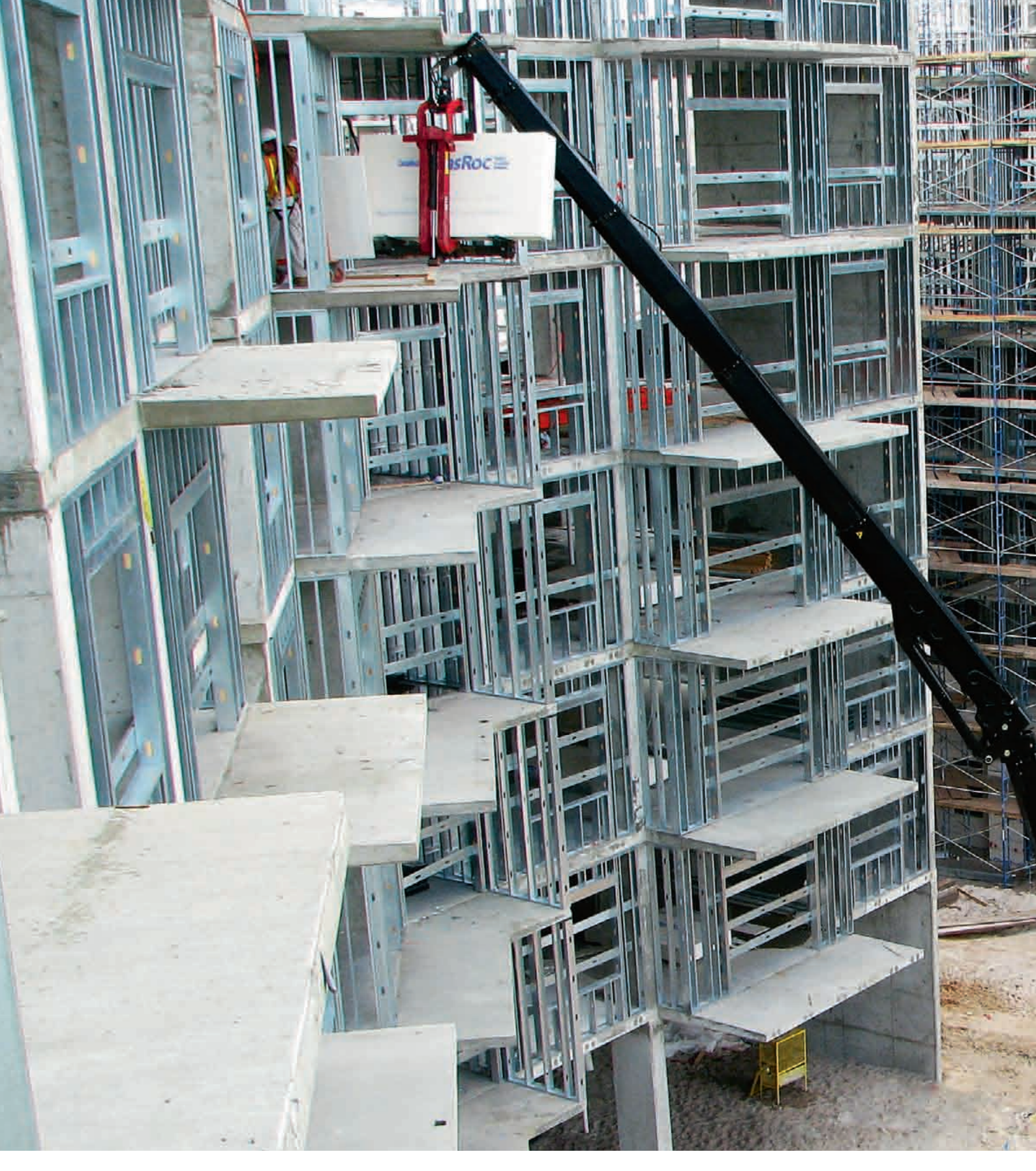
Speedy delieveries 92' up from ground lev